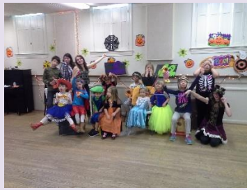
The Little Theatre of Alexandria's Youth Education Classes Celebrating Halloween

Come join the fun in one of our Winter/Spring 2016 classes – for all ages! Join us for our Open House Registration at LTA on Saturday, January 9, 2016, from 10:00 a.m. to 12:00 noon.